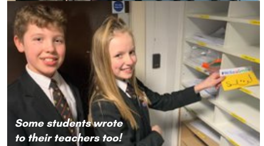
Some students wrote to their teachers too!