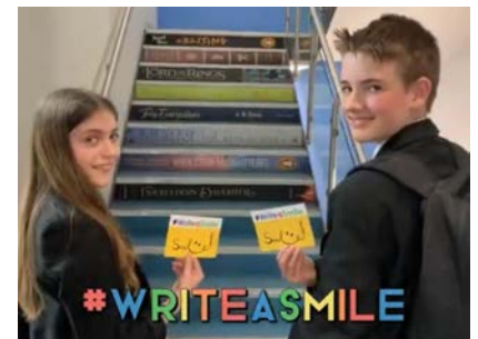
Above: Students are the stars of the #WriteASmile promo video