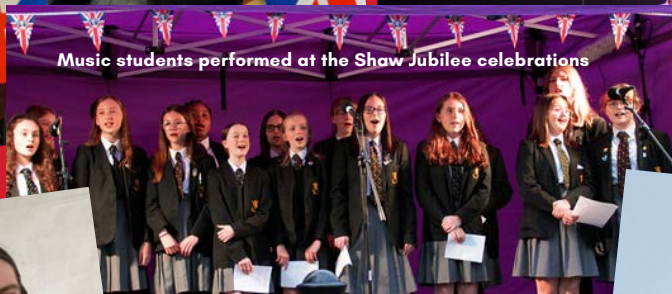
Music students performed at the Shaw Jubilee celebrations