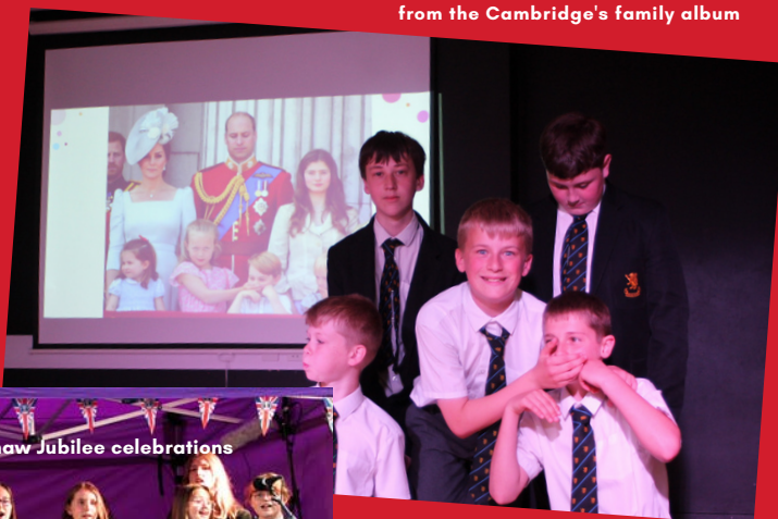
Music students performed at the Shaw Jubilee celebrations