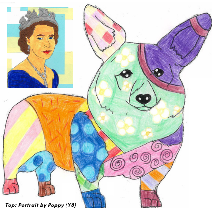
Top: Portrait by Poppy (Y8) Below: Corgi by Abigail F (Y7)