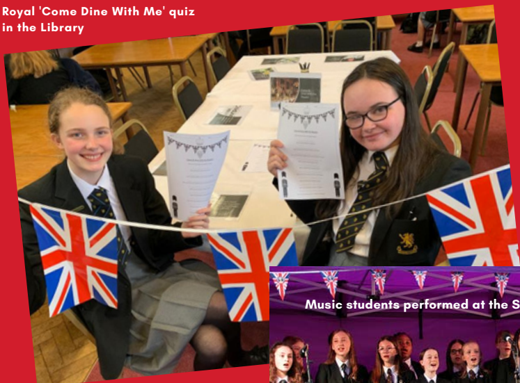
Royal 'Come Dine With Me' quiz in the Library