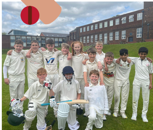
Y7 Boys are through to the Oldham Cricket cup finals after winning by 10 wickets in their game against Radclyffe. Well done lads!