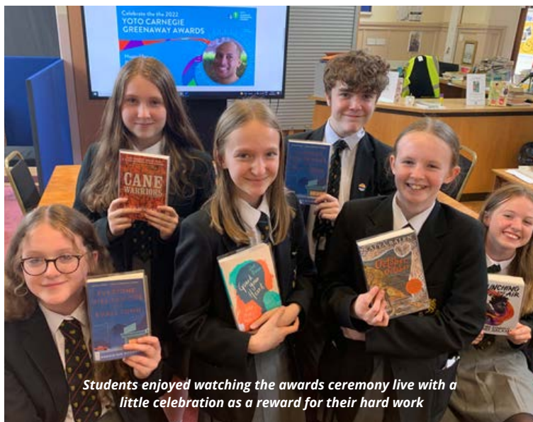
Students enjoyed watching the awards ceremony live with a little celebration as a reward for their hard work

Students thoroughly enjoyed the experience and some of their comments were: