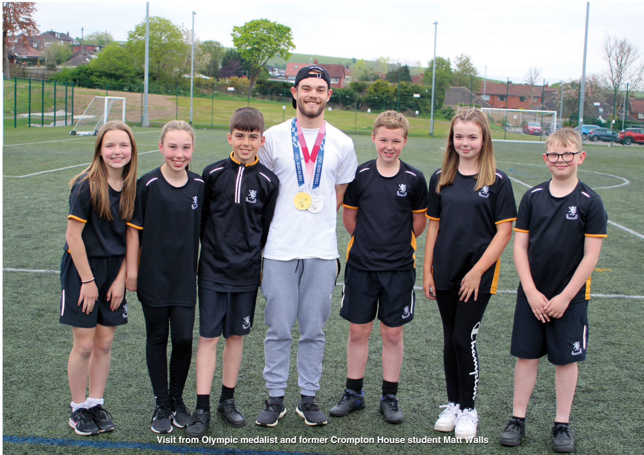
Visit from Olympic medalist and former Crompton House student Matt Walls