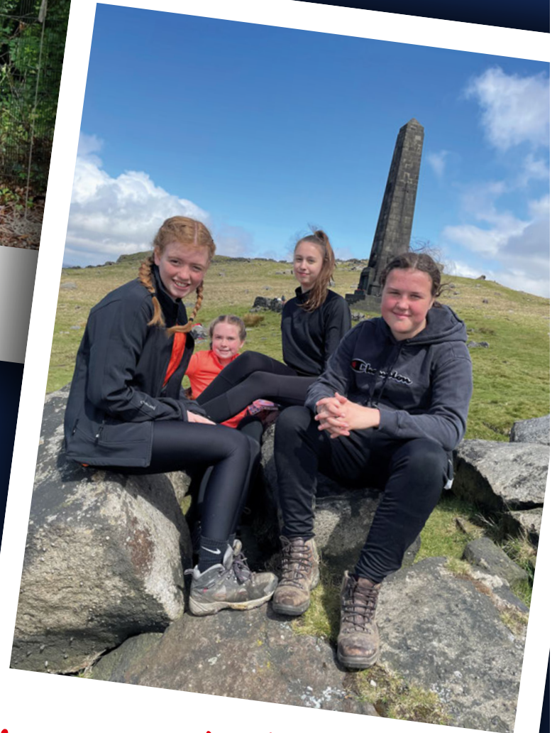
Duke of Edinburgh Bronze