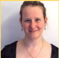
Cat O'Gara Foundation Ex- Officio Governor