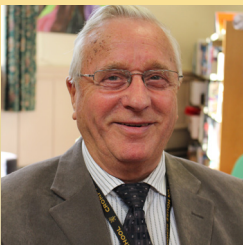
Leon Ashton Foundation Governor